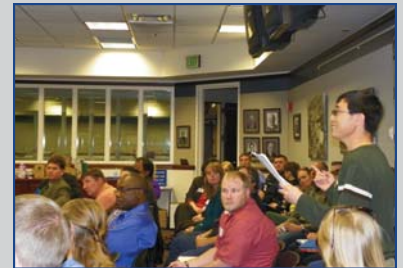
Participants at the 2010 Road Show offer their views on how to reduce traffic-related fatalities and serious injuries.

It does not cost anything except a couple of hours of your time to attend. Register for free at http://camsys.qualtrics.com/SE/?SID=SV_9zwSGWQS4H72LGJ .