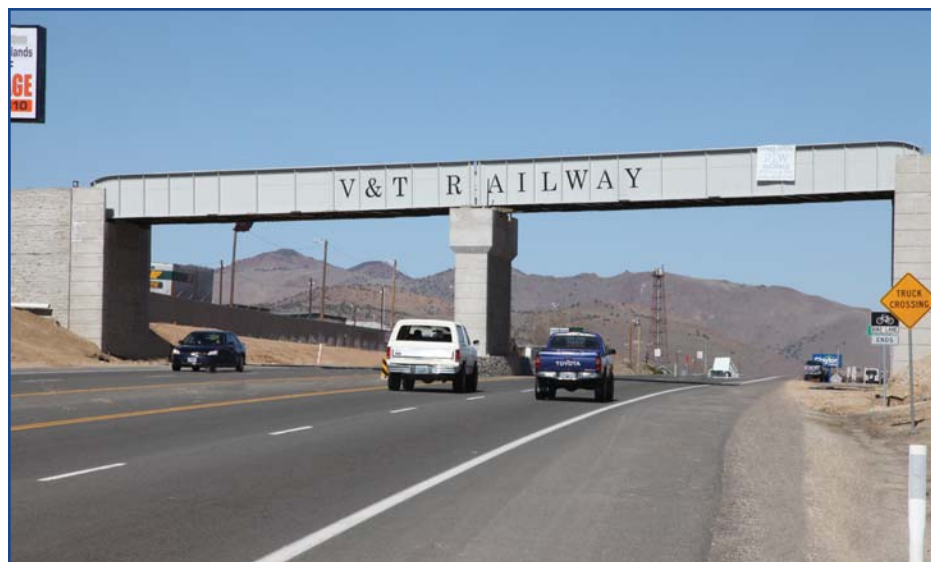
Highway 50 in Nevada.

The intent of the Highway 50 Safety Plan is to focus the attitude and behaviors of drivers more on safety. The plan includes widespread media and public education, enhanced aggressive enforcement activities, and both short- and long-term safety engineering improvements. Some other activities include road safety audits by NDOT to identify some of the needed infrastructure improvements, signage about the program, and zero tolerance enforcement details. NDOT recently widened U.S. 50 near the Silver Springs area and implemented high T-intersections for safer turn movements, frontage roads, roadside fencing, and an undercrossing to help reduce vehicle-animal collisions.