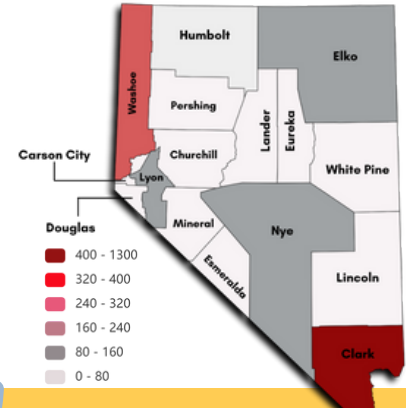
Fig. 2 CPS-Related Citation Frequency by County

Younger drivers are more likely to be cited for inappropriate child passenger safety use but resources are available for